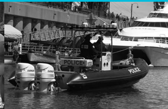
Incidents regularly occur on the bodies of water surrounding the SPVM territory. The Patrouille nautique is another means to safeguard the lives of Montrealers.