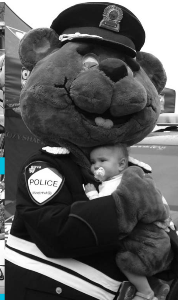
The SPVM is making more efforts to get closer to youth. Our new mascot Flik is a great ambassador who even attracts our youngest citizens.