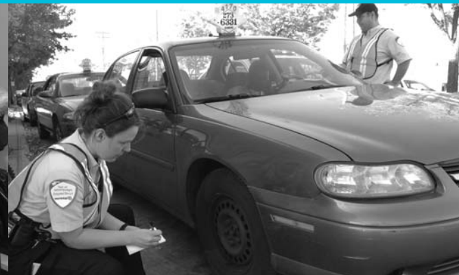
The taxi inspectors ensure that the vehicles comply with standards so the users can enjoy safe, high-quality service.