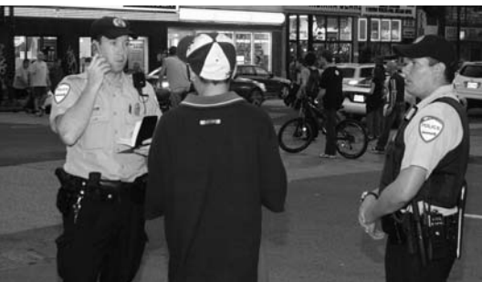
The officers who patrol downtown are often called on by passers-by who need information.