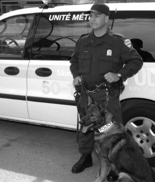
Seeing police patrolling the metro reassures the users. Many people are surprised and pleased when the patroller is from the canine unit.