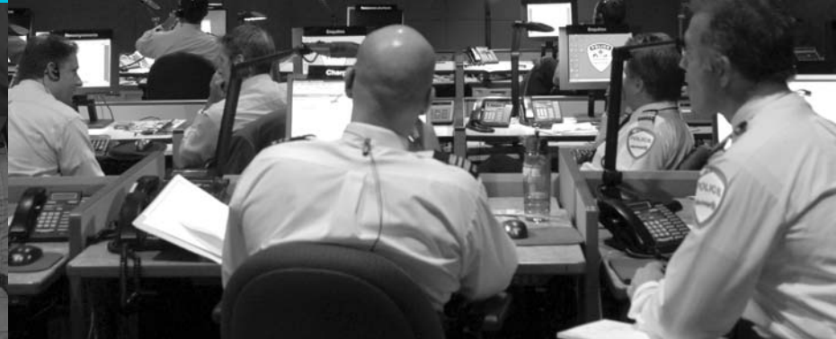
For unusual or large crowd control events, SPVM decision-makers and partners – like Urgences santé – get together at the Centre de commandement et de traitement de l'information (CCTI) where they can access all the information they need to manage the situation properly. Multipurpose screens allow them to consult maps of the location and visualize what is going on.