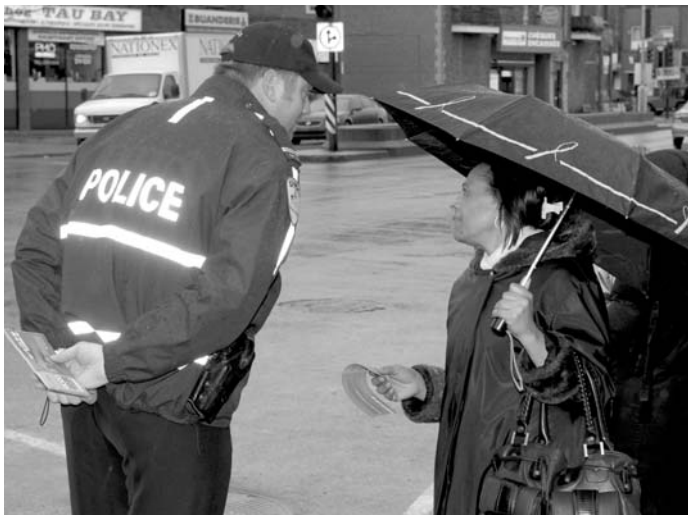
The pedestrian safety campaign is a perfect opportunity for police officers to make citizens aware of what they can do to protect their own safety.