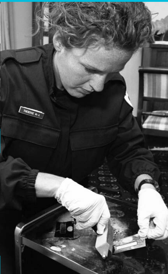
A forensic identification technician lifts fingerprints.