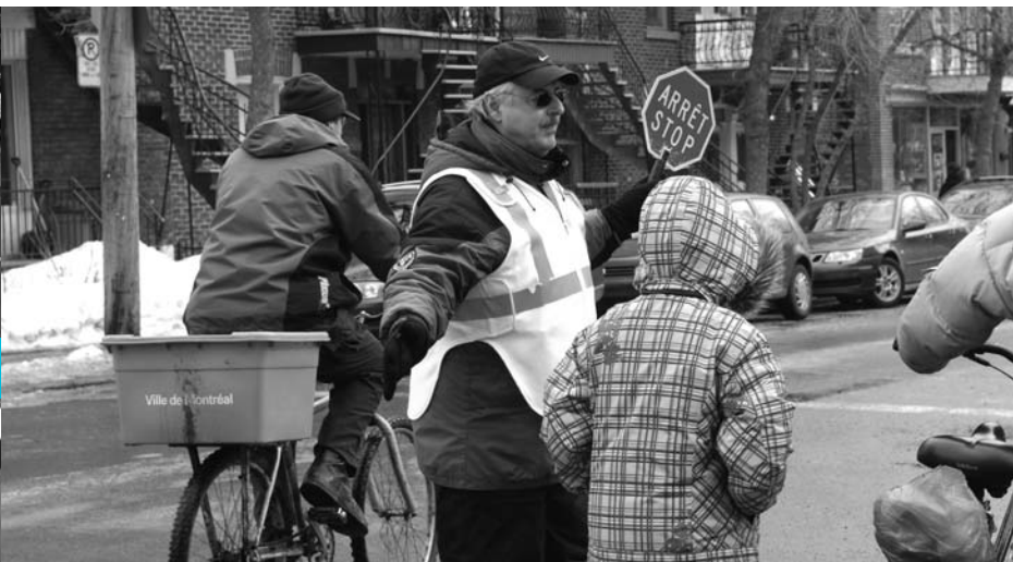
This school crossing guard is a critical link for achieving the SPVM's mission, safeguarding children, an important focus of SPVM action, and improving road safety, another SPVM priority.