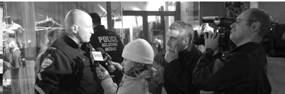
Interviews granted by SPVM public relations staff are one of the ways we keep the public informed about particular events or ask for their support.