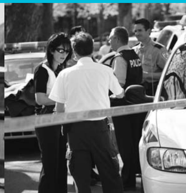
A commanding officer, an investigator, communications specialists, and forensic technicians all work together closely at a crime scene.