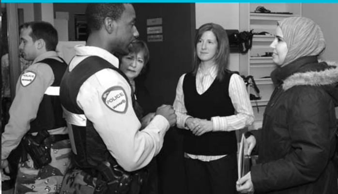
Montréal is a pluralistic city where police officers of different origins interact with the diverse citizenry: an example of daily openness and tolerance.