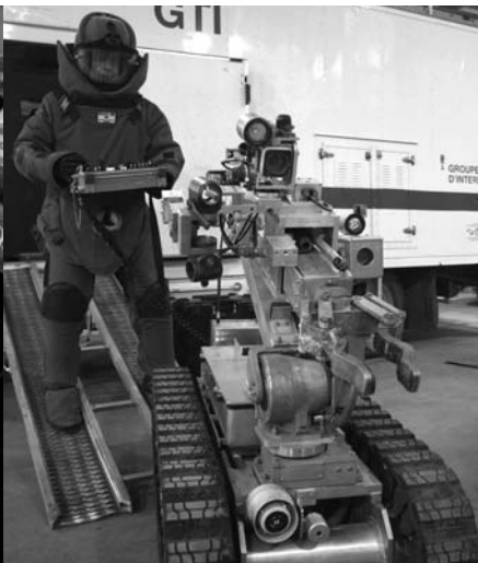
An officer from the Groupe tactique d'intervention activates the bomb defusing robot.