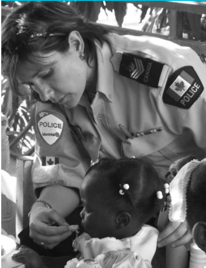
Working on a foreign mission in Haiti entails doing lots of little things to help the people.