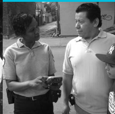
A parking agent explains to a citizen how the computerized ticketing machine works.